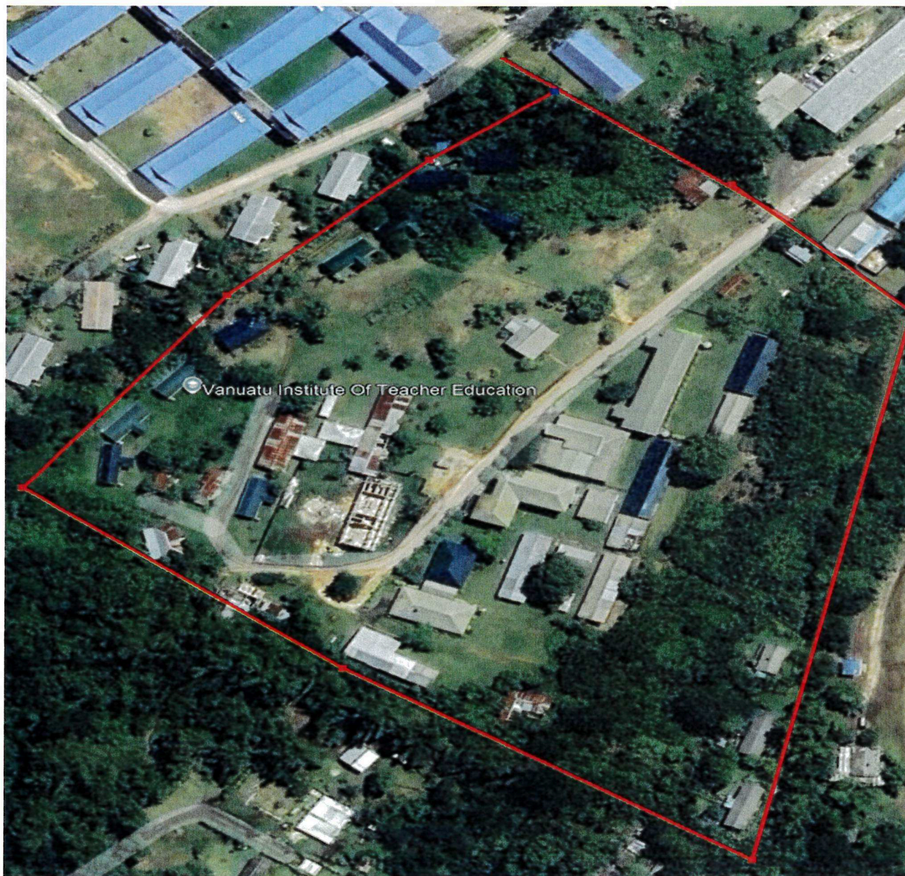
Map2. (School of Education)